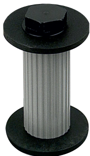
Dimensions in mm